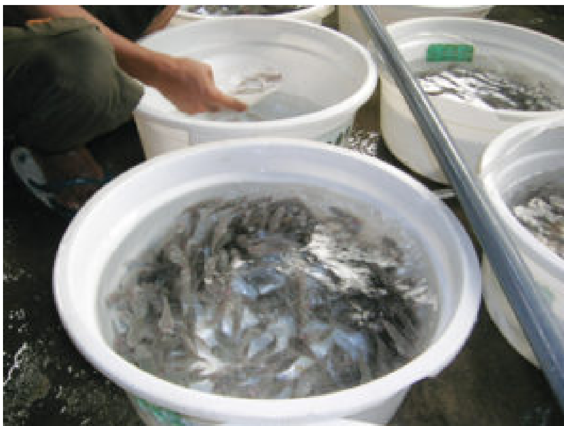
Grouper juveniles reach 5 cm in total length before transfer to net cages for grow-out.

Seawater used for the larval-rearing tanks is pretreated in a sand filter. The water salinity ranges 34-35 ppt and water temperatures range 28.5 to 29.5 degrees-C. Newly hatched larvae are stocked at an initial density of 10 larvae/l. Live food for the larvae consists of microalgae, rotifers and Artemia nauplii. Artificial diets are introduced prior to feeding artemia nauplii. The larval-rearing protocol is summarized in Fig. 1.