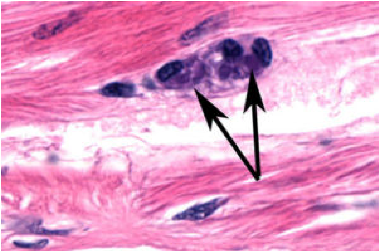
Fig. 2: Basophilic inclusion bodies are evident in these groups of muscle cells. Magnification: 150x.

histopathology, shrimp with acute-phase IMN present lesions with coagulative muscle necrosis, often with edema. In shrimp recovering from acute IMN or those in its more chronic phase, the necrosis appears to progress from coagulative to liquefactive. This progression is accompanied by hemocytic infiltration and fibrosis (Fig. 1).