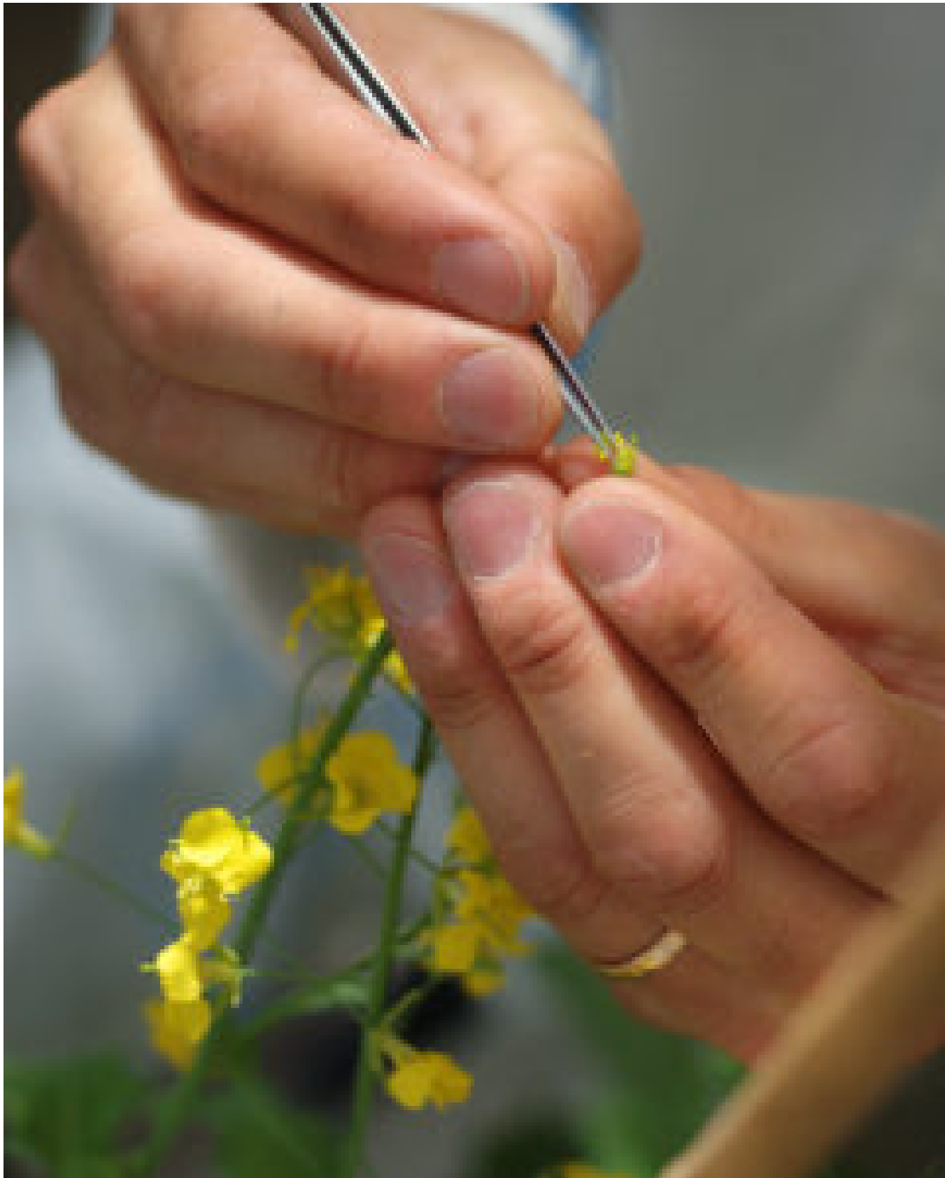
In addition to aquafeeds, other possible markets for the canola-derived product include livestock animals that need omega-3 oils in their diets.

company's business model is to work with farmers to grow the canola and then Nuseed delivers the product to the end users, in this case aquafeed formulators. This closed-loop approach helps ensure quality and control by, among other things, preventing the modified canola from being mixed with the