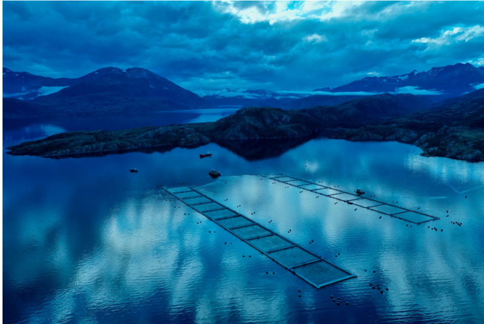
Nuseed worked with partners in Chile to conduct commercial scale trials on Atlantic salmon.

Studies in the field indicate that Nuseed's canola oil can provide a benefit when used in feed, according to Pablo Berner, the company's aquaculture lead in Chile. Nuseed worked with partners to conduct three commercial scale trials in Chile in 2018 and 2019 on Atlantic salmon, the company's initial target market for its product. Each site had 16 to 24 cages, with roughly 40,000 to 50,000 fish in each cage. There were both control and experimental groups of fish.