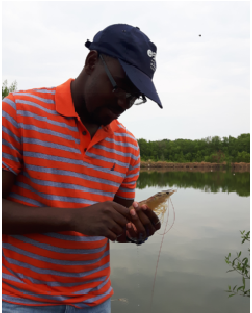
"This innovation can be expected to become a key health strategy in shrimp farming going forward," said Simao Zacarias.