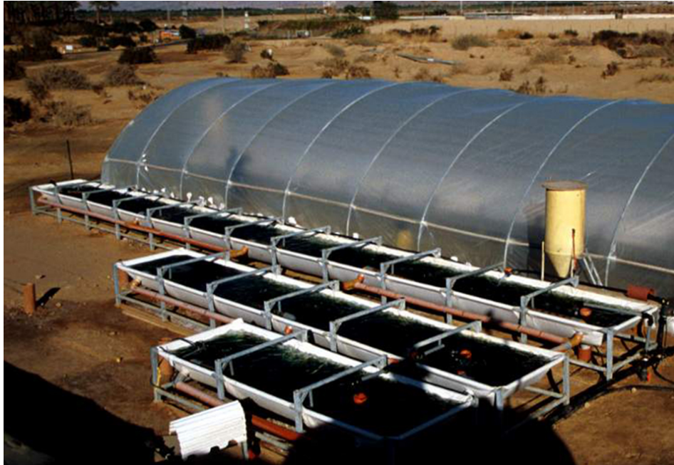
The experimental system used seaweed biofilter tanks (foreground), and an experimental fish tank under the greenhouse cover.

In aquaculture production systems, no more than about 30 percent of the nitrogen in formulated aquafeed is retained as growth by the cultured species while the excess is mainly released as dissolved, toxic ammonia. Most aquaculture species have a low tolerance to ammonia-toxicity, and a high rate of water exchange is necessary to maintain adequate culture conditions. To reduce the use of fresh seawater by implementing recirculation, many land-based production systems have adapted the use of bacterial biofilters that convert ammonia into less toxic forms, but the discharge may still have an environmental impact. The use of integrated mariculture systems incorporating seaweed (sea lettuce, Ulva lactuca ) biofilters is a relatively new approach that addresses this issue and promotes more sustainable production.