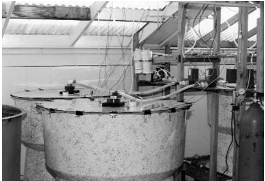
Algae was grown in covered, conical tanks made of fiberglass.

The daily start and end times for algal culture sampling and harvesting operations were 8 a.m. and 8 p.m. to cover the range of observed algal growth in the greenhouse. Between these hours, the chambers were sampled every two hours to estimate the standing algal biomass. If the estimated biomass was lower than the harvest set point, the sampling procedure ended and repeated in two hours. If the estimated biomass was greater than the harvest point, command actions initiated the harvest cycle.