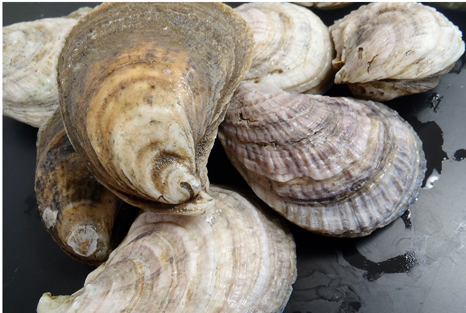
The Eastern oyster ( Crassostrea virginica ).

One concern with selective breeding as part of a population management strategy is that captivity itself can impose unintended artificial selection. Evolutionary responses to this “domestication selection” can be swift in captive populations with the potential for reduced fitness in the wild relative to wild-born individuals.