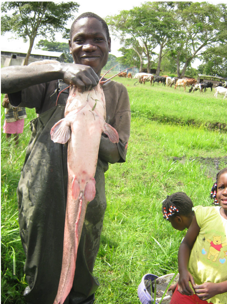
A Ugandan farmer with catfish broodstock, photographed in 2011 by Anton Immink.

Editor's Note: This is part 2 of a two-part series. Click here to read part 1. ( https://www.aquaculturealliance.org/advocate/investing-africas-aquaculture-future-part-1/ )