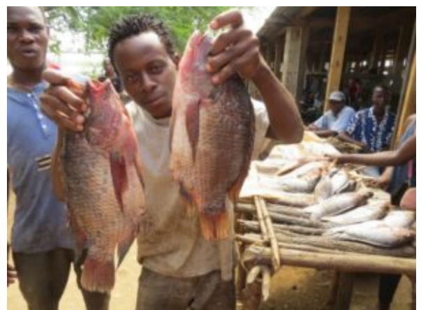
Workers at the Chicoa Fish Farm.

“Having to get involved earlier, from the ground up, maybe, that’s where the extra risk comes from,” he added. “You have to be more patient. You need to be a bit more flexible than usual. If you have a good eye for a deal, and have a long-term outlook with maybe