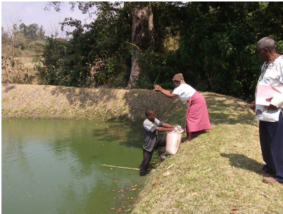
Feeding chambo stock and fingerlings, near Blantyre, Malawi, Africa in 2012.

The first of seven aspirations, as laid out by the African Union in its ambitious report, Agenda 2063: The Africa We Want ( http://www.un.org/en/africa/osaa/pdf/au/agenda2063.pdf ), is really quite simple: "A prosperous Africa based on inclusive growth and sustainable development."