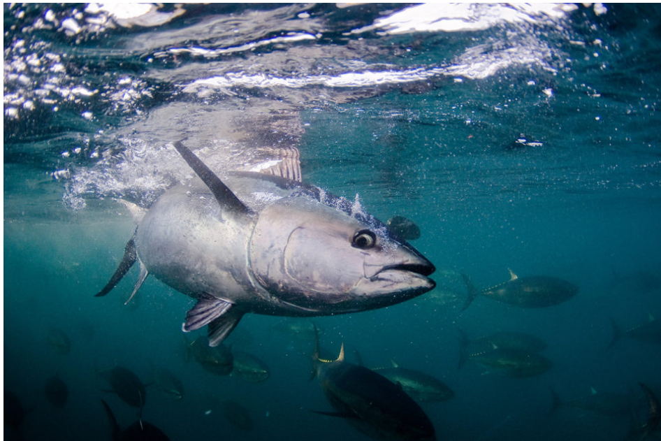
Bluefin tuna at an aquaculture facility off the coast of Japan.

Prized for its high fat content, bluefin tuna are perhaps the most prized fish in the ocean. In the modern sushi industry, hon-maguro 's popularity reigns supreme, as many consumers admire its fresh red flesh, one raw bite-sized cut at a time.