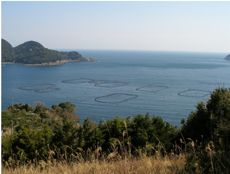
A site in Kumano, Mie Prefecture – one of 10 bluefin tuna farming sites belonging to Maruha Nichiro.

Eventually, in 2002 Kindai made a breakthrough, producing the world's first generation of fully farmed Pacific bluefin using the fertilized eggs of artificially hatched, farm-raised parents. The latest generation was produced in 2012.