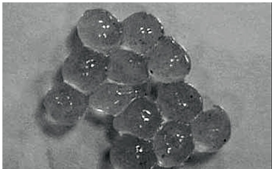
Isochrysis galbana in alginate beads.

Therefore, Ca-alginate appears to be an ideal gel for entrapment of the microalgae. The preparation of alginate-bead is easier, cheaper, and more readily available than such other methods as cryopreservation.