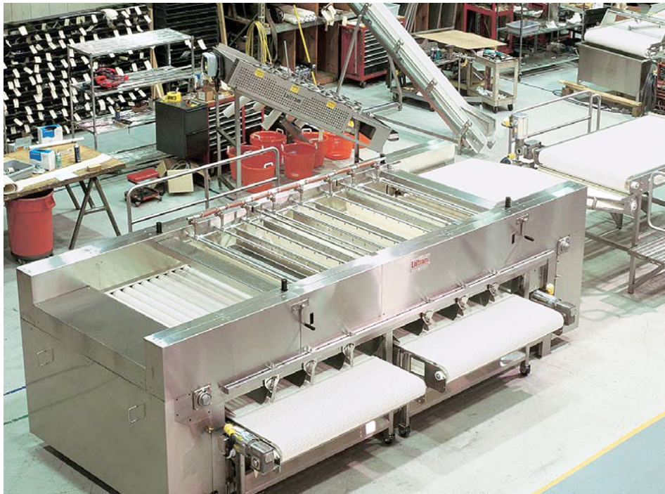
An example of a discrete-gap roller bed grader, with wash tank/inspection belt, feed conveyor and horizontal roller bed.

Most shrimp processors already understand the many ways in which grading adds value to their products. Processors who cook shrimp, for example, view grading as a quality control step that helps ensure consistent cooking. Of course, processors also grade for marketing purposes: packaging shrimp by size range increases customer convenience and attracts higher prices for the larger product sizes. Proper grading is a crucial quality control step. In order to reap the maximum benefits of shrimp grading, a processor must choose a method that combines accuracy and efficiency with gentle product handling. Options include hand grading or several methods of automated grading.