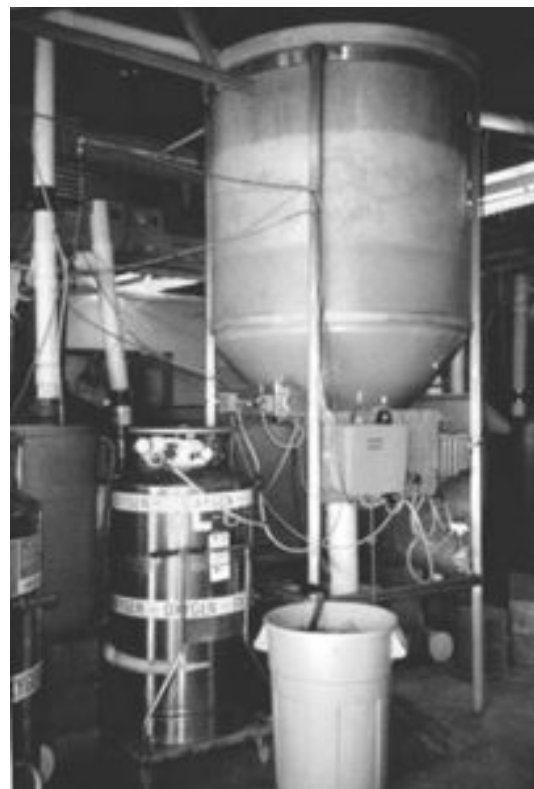
Microbead filter at Cornell University.

The beads are created by a steam heat treatment of the same raw crystal polymer used for disposable drinking cups. The beads cost around U.S. $4 per kilograms.