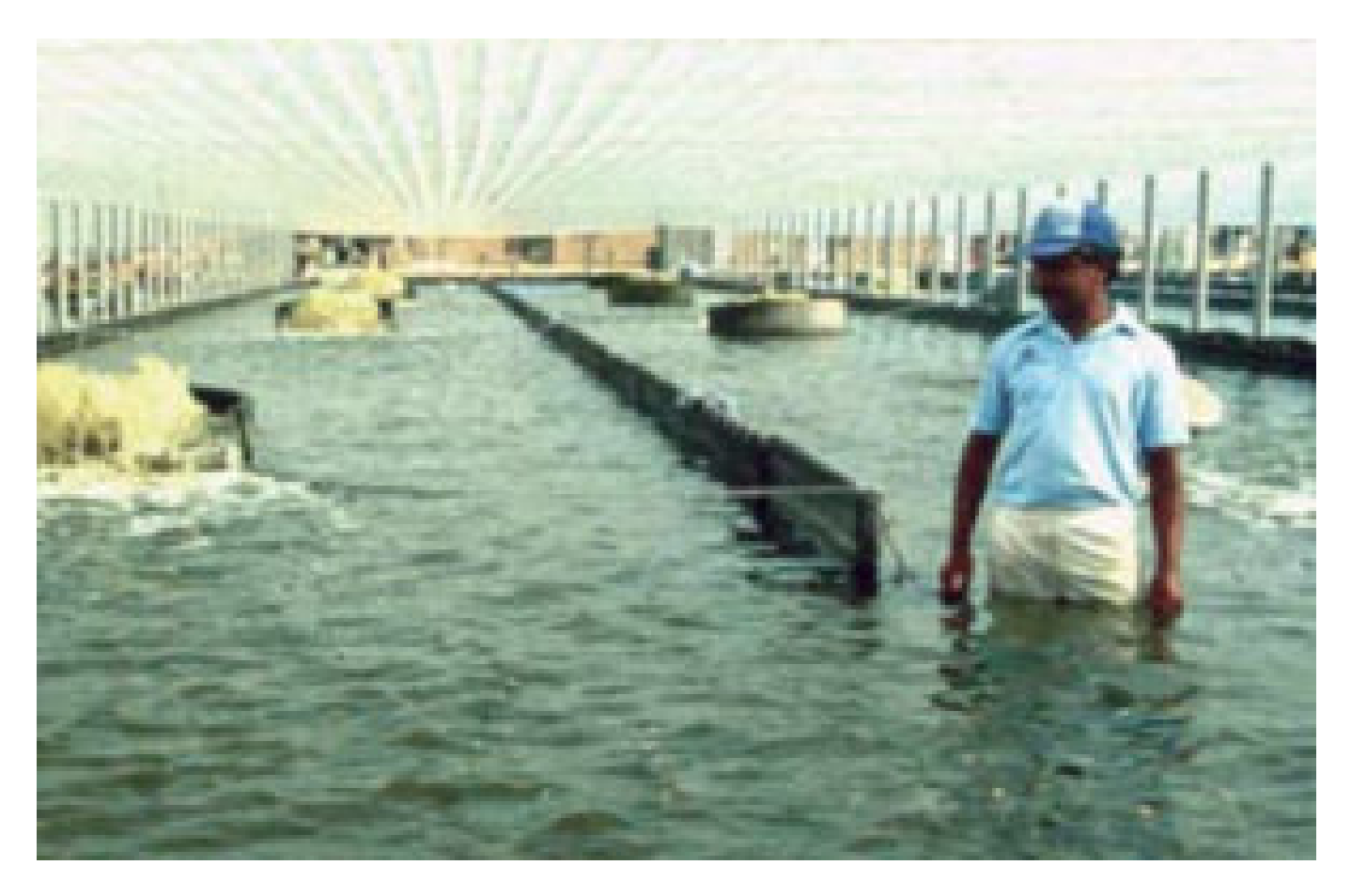
The tilapia fingerling production raceways at Solar AquaFarms used microbial flocs for both water treatment and natural food.