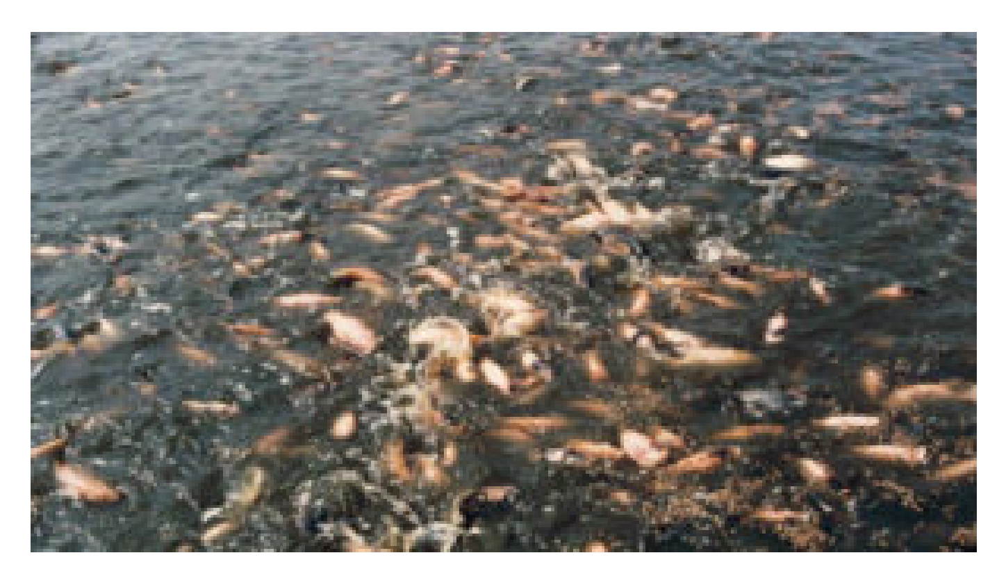
Tilapia were raised in high-density tanks with microbial floc as the sole treatment system at Solar AquaFarms in California, USA.

wastes for use in several beneficial ways.