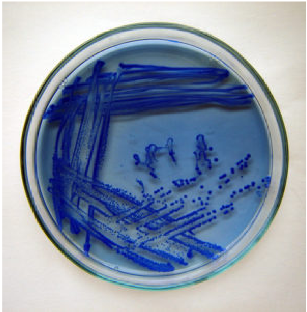
Lactic acid bacteria grown in agar with aniline blue indicator appeared blue.

Resistance to biliary salts. Biliary salts have an emulsifying function, increasing the solubility of fats and fat-soluble vitamins to help in their absorption. This detergent effect is microbicidal because it can affect the phospholipids and fatty acids on the walls of the microorganisms. For a probiotic to efficiently colonize an animal's digestive tract, it is important for it to resist the action of biliary salts.