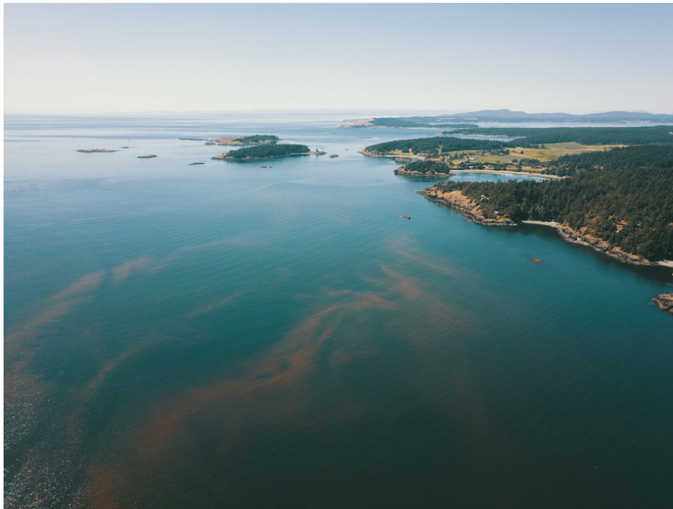
An aerial view of a harmful algal bloom in Washington's San Juan Islands.

The news wasn't welcome. It also wasn't entirely unexpected.