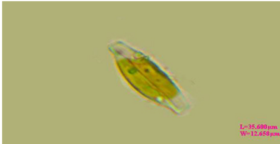
Cell size of Amphora gamma Karsten.