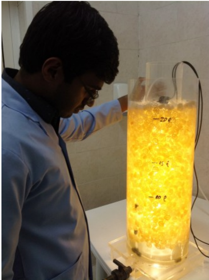
The intra-luminic, photosynthetic, cylindrical reactor.

The aquaculture industry in desert regions can benefit significantly from the nutritional and therapeutic properties of Amphora . Extracting an optimal exopolysaccharide (EPS) output from benthic diatom film manipulation is crucial in shrimp pond ecosystem, facilitating synergistic/coordinated actions between Amphora , for example and the associated bacterial flora (with Actinobacteria as principal dominants). General bio-filming periphyton and hypoliths (cryptic microbial assemblages) act as balanced nourishment for shrimp.