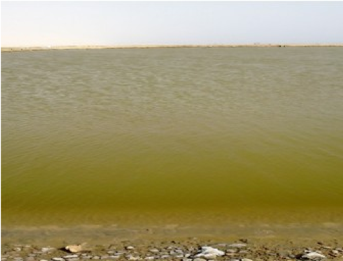
Controlled blooming of suspended/non suspended diatoms in a desert-saline shrimp pond.