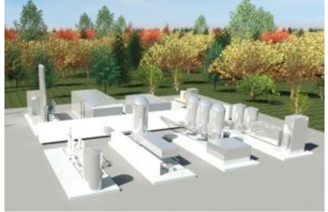
An artists' rendering of the NovoNutrients pilot system.

Last fall, NovoNutrients announced partnerships ( https://www.aquaculturealliance.org/advocate/novonutrients-partners-up-on-its-pathway-to-commercialization/ )