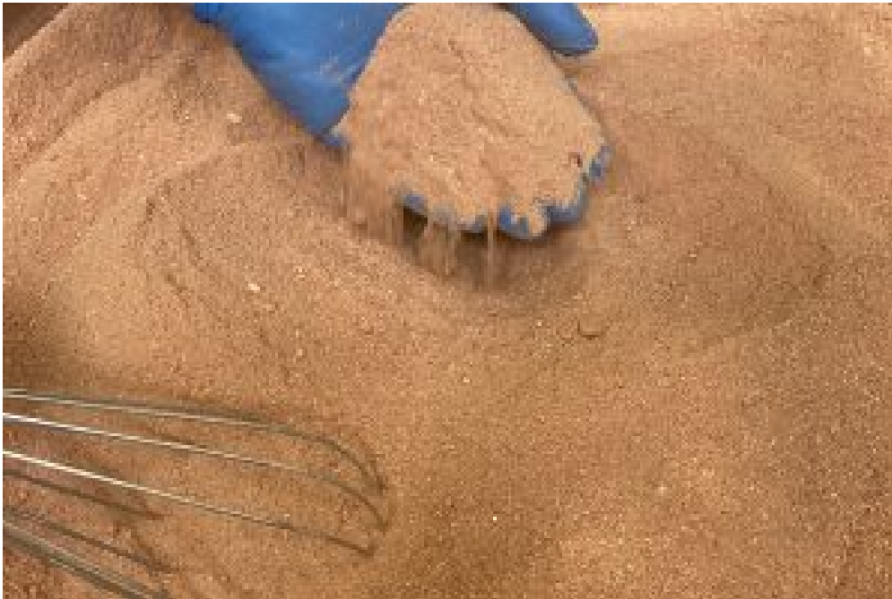
The NovoNutrients Protein is a microbial meal using industrial waste streams as an energy source.

NovoNutrients, a U.S.-based producer of microbial meals for aquafeeds using industrial waste streams, has recently secured a total of (U.S.) $9 million in equity to scale production.