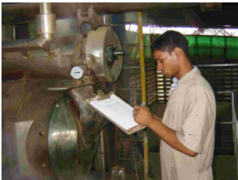
Proper record-keeping by trained personnel is a key step during aquafeed manufacturing.

Once the operator is sure that the pre-conditioner, holding bin and pellet mill are in good working order and clean, the process can be started. Upon starting, the operator must also collect samples of the mixed formula before the pre-conditioner and determine its moisture, temperature, and bulk density. The moisture content can be measured on site using infrared lamps. Once the process has started the operator must collect samples at the exit of the pre-conditioner and measure directly the temperature as well as the moisture. Based on the results of the measurements, the operator can make the necessary adjustments to the feed rate, pre-conditioner speed, and the steam addition in order to achieve the desired mash temperature and moisture.