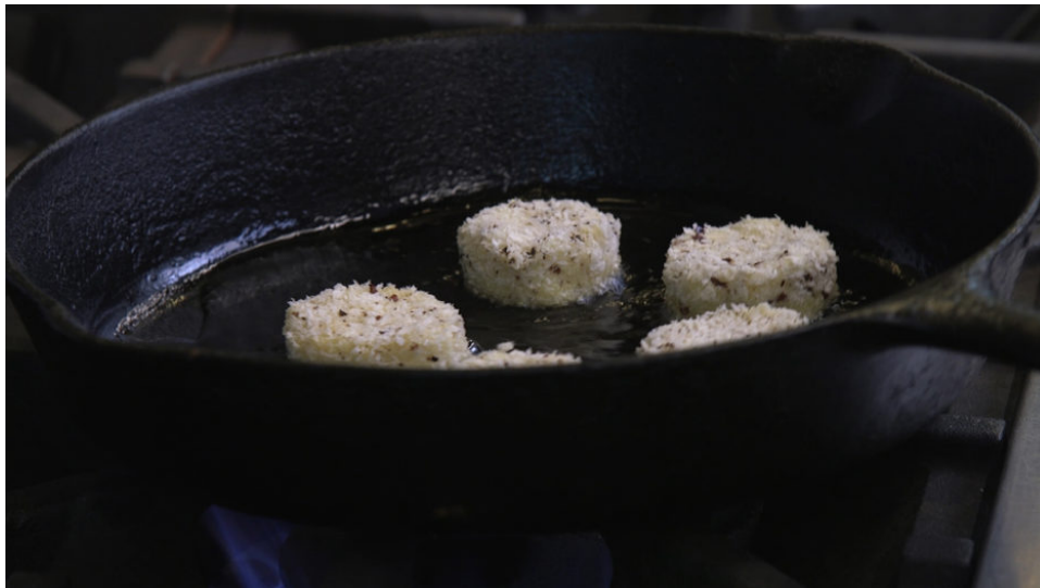
Finless Foods will likely bring an "unstructured" fish product to market first. Here the company prepares samples for tasting.

"If people want only fish fat, we can do that. If they want lean meat we can do that," he said. "We can create the most valuable cut of a fish every time."