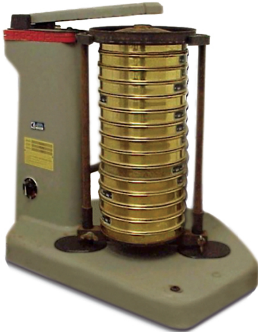
Fig. 1: Ground ingredients are analyzed for particle size using sieve sifters.