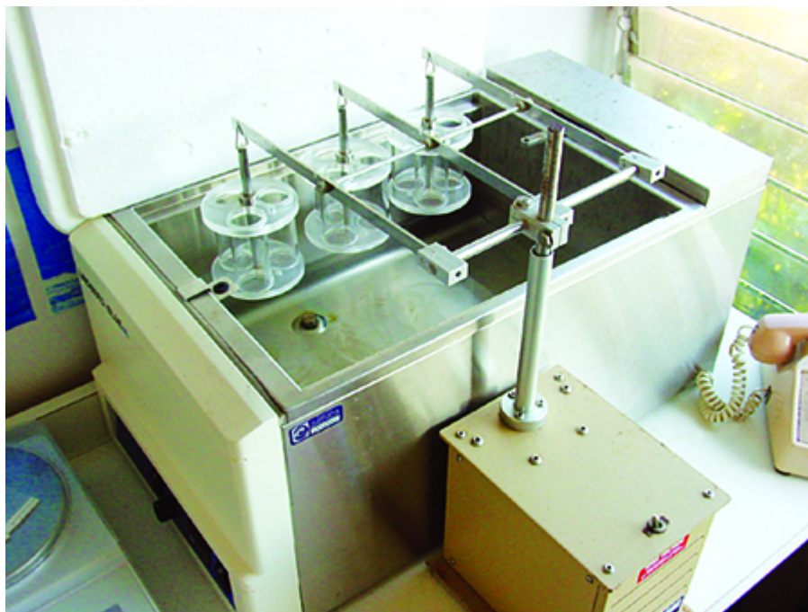
Fig. 3: Water stability testers immerse and agitate feed samples.

The horizontal and vertical methods have adjustable shaking speeds to simulate the required water movement and pellet agitation. Pellet water stability is usually determined after 1 to 2 hours of immersion in water, and calculated as the ratio of leached pellet matter to the original pellet matter multiplied by 100. Fig. 3 shows the vertical shaking method.