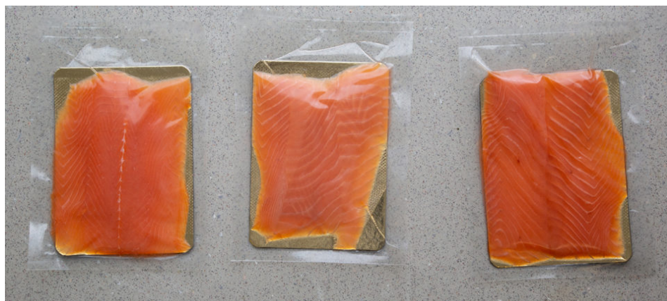
Retailers are interested in the sustainability attributes of the CuanTec packaging solution.