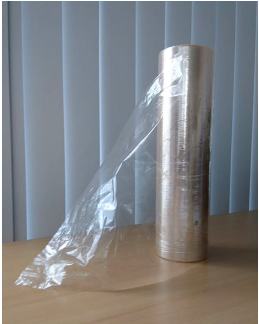
A roll of the CuanSave product.