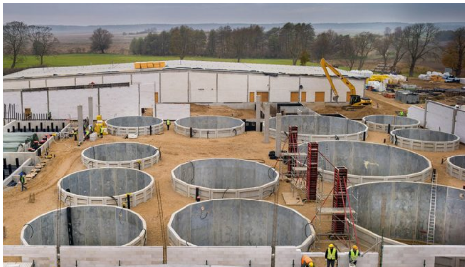
Jurassic Salmon in Karnice, Poland.