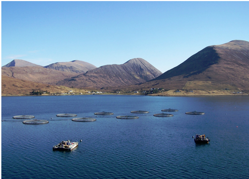
Salmon farming at Loch Ainort, Isle of Skye, Scotland.

The main objectives of Precision Fish Farming (PFF) are to 1) improve accuracy, precision and repeatability in farming operations; 2) facilitate more autonomous and continuous biomass/animal monitoring; 3) provide more reliable decision support; and 4) reduce dependencies on manual labor and subjective assessments, and thus improve staff safety. Through these means, PFF will improve animal health and welfare while increasing the productivity, yield and environmental sustainability in commercial intensive aquaculture.