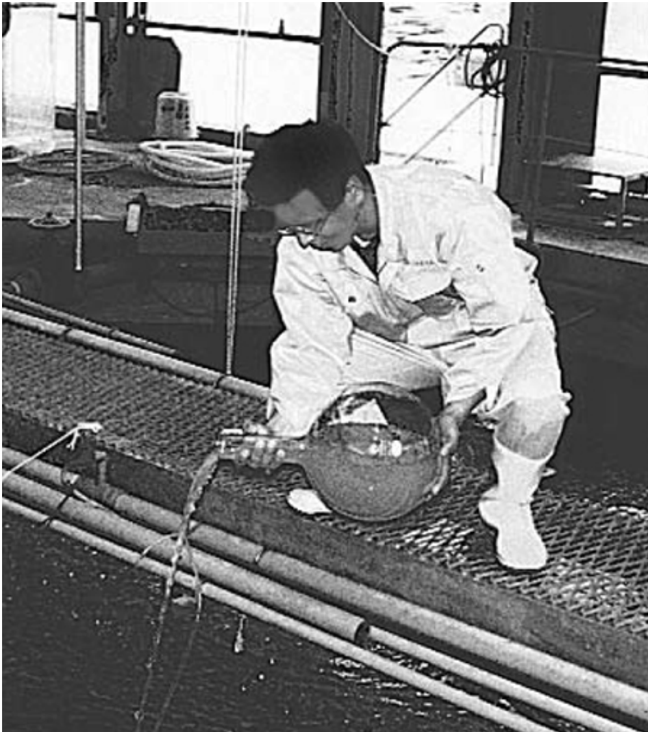
A bacterial strain cultured in ZoBell 2216E medium in seawater for four days was added to seawater containing striped jack larvae.