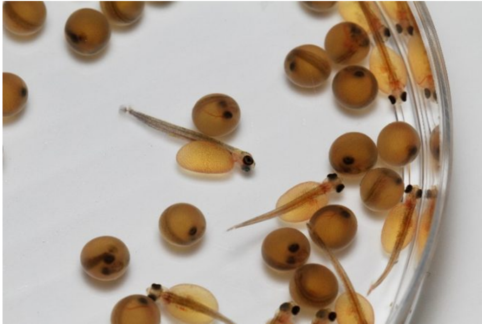
Hatching of Arctic charr eggs.

Over the last two decades, scientific and technical efforts have been deployed in Canada to characterize the Arctic charr strains collected from the wild by government agencies, to accelerate their domestication, to improve their growth potential through selective breeding and to develop environmentally friendly husbandry techniques. The three Arctic charr strains currently farmed in Canada are the Fraser, Nauyuk and Tree River strains, which originated from the Fraser River in Labrador, Nauyuk Lake in Nunavut, and Tree River system in Nunavut, respectively.