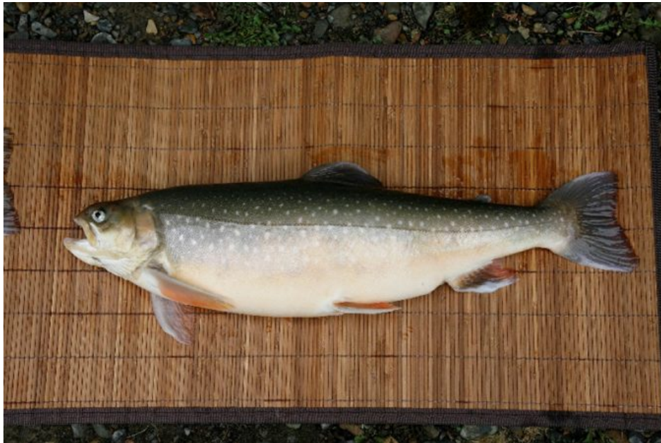
Adult Arctic charr ( Salvelinus alpinus ).

In Canada, there is a growing interest in aquaculture production, which represents about 15 percent and 20 percent of the total seafood volume and value, respectively. Salmonids – including Atlantic salmon, trout, steelhead and Arctic charr – represent the most cultivated aquatic organisms in the country. The Arctic charr ( Salvelinus alpinus ) is a cold-water fish species that grows well at the northerly latitudes in Canada and northern United States, as well as other Nordic countries such as Iceland, Sweden and Norway.