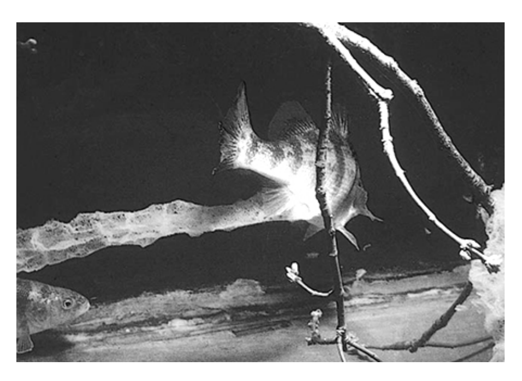
Spawning female yellow perch (Perca flavescens) and trailing egg ribbon.