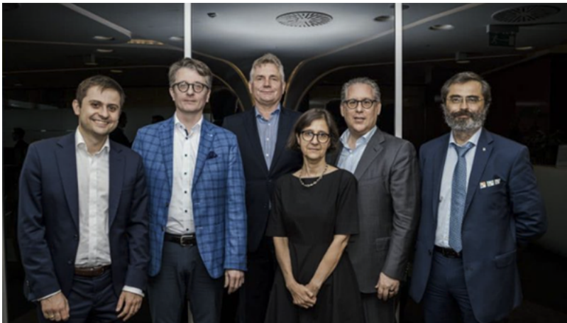
The Proteon Pharmaceuticals team.

Poland-based Proteon Pharmaceuticals secured a €21 million investment to accelerate the commercialization of its bacteriophage-based products, which it says can reduce aquaculture's reliance on antibiotics, the company announced on Tuesday.