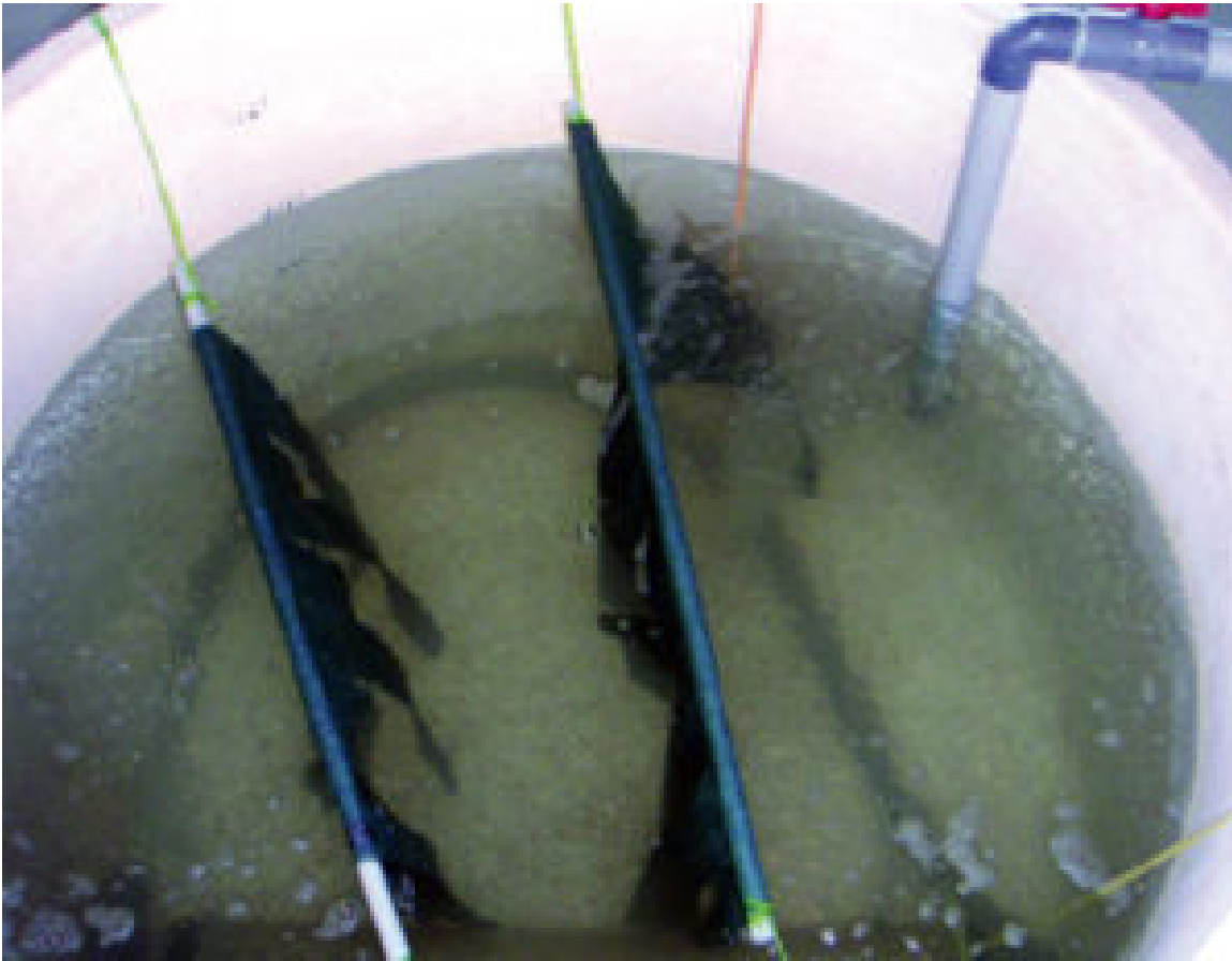
The author's small-scale RAS cultured shrimp from nauplii to postlarvae at high density.