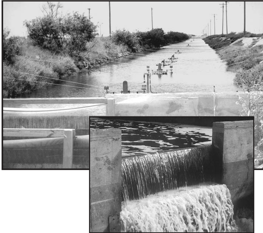
Above: Drainage ditch with aerators and weir. Inset: Volume of effluent has been dramatically reduced and the quality improved.

Recent shrimp farming technology called for high rates of pond water exchange as a means of maintaining water quality by flushing out organic waste and excessive phytoplankton. However, this approach transports dissolved and suspended wastes into receiving water bodies, where excessive enrichment can occur. A major challenge facing shrimp farmers is the development of cost-effective technology for reduction of water use and waste discharge. This paper describes the experiences of the Arroyo Aquaculture Association (AAA), a cooperative shrimp farm in south Texas, in developing technology to meet more stringent water discharge regulations.