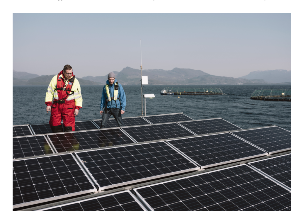
Renewable energy solutions are likely to significantly cut emissions on a fish farm.

Aquaculture relies on energy. And with this dependence on energy comes the responsibility of ensuring that it's used efficiently with minimal environmental impact. Some farms are now investigating this with the help of renewable energy.