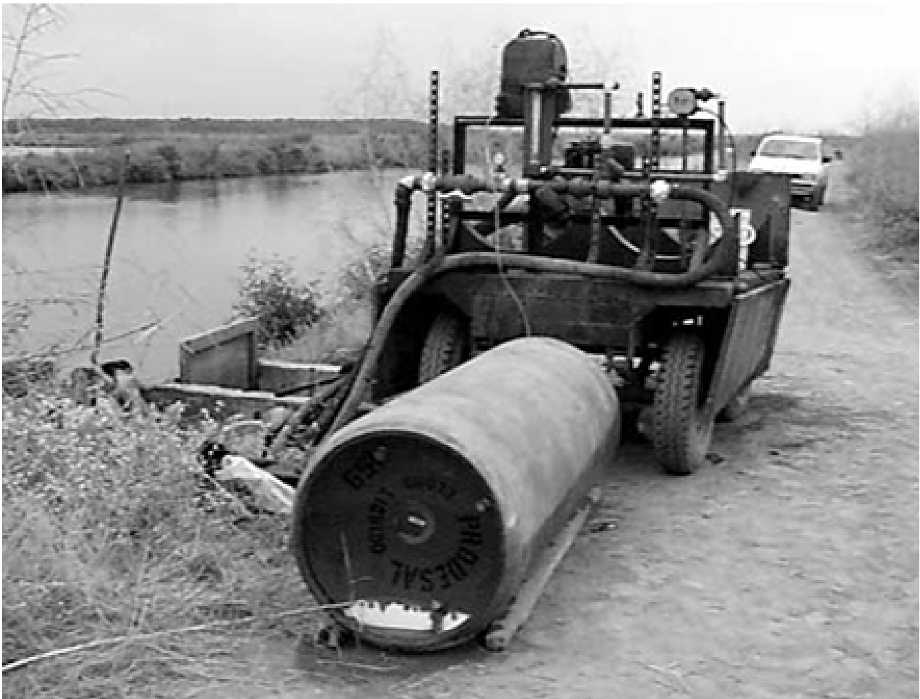
Chlorine gas being dosed from cylinder (foreground) to water entering inlet gate of shrimp pond (left).

shrimp tissue and present a food safety problem, or be hazardous to workers in the shrimp industry.