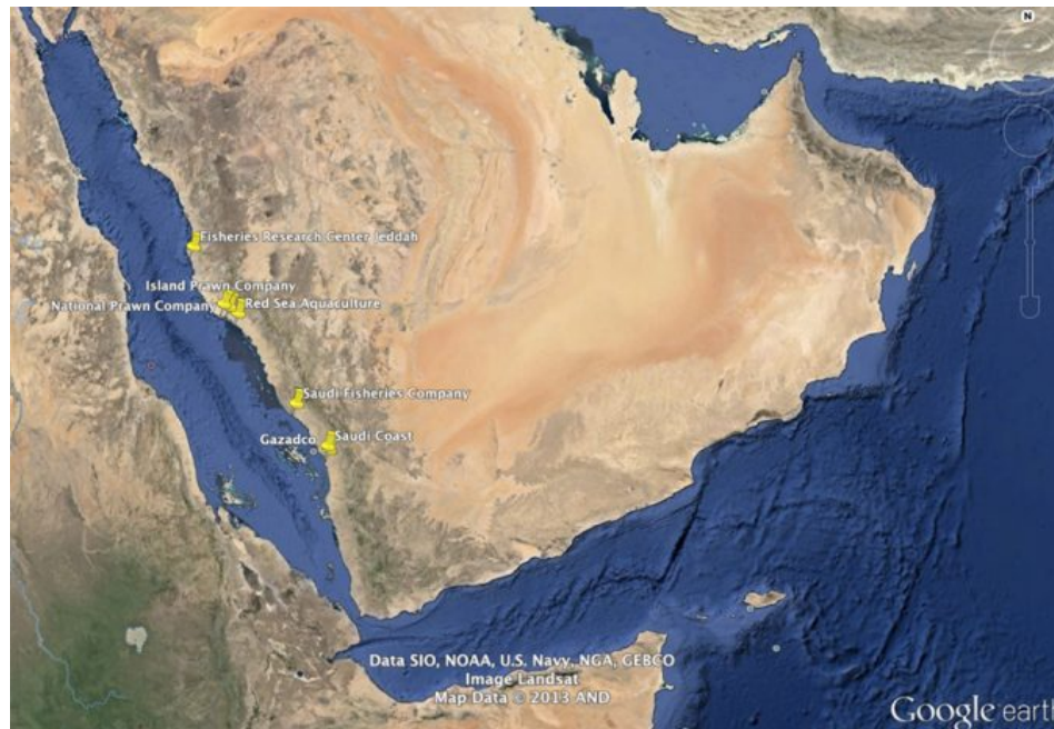
Fig. 1: Locations of shrimp farming facilities in the Kingdom of Saudi Arabia.