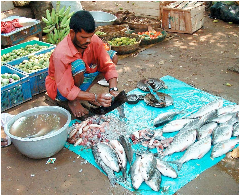
Rohu are a popular fish choice at this market in Orissa, India.

With a population of 1.04 billion and annual growth of about 18 million, India sets major demands for increased food production. But the availability of land and water resources is depleting day by day. Therefore, an increase in unit-area productivity is strongly required to meet the country's food requirements.