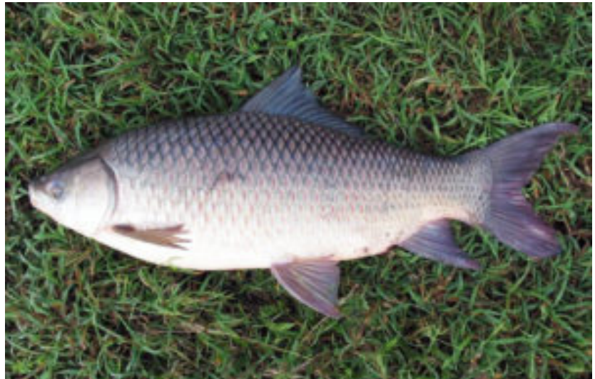
About 500,000 mt of rohu carp are grown in India each year.

Furthermore, hatcheries follow few genetic norms in the production of seed. The result is fry with low survival and growth – a problem partly linked to the great reproduction of carp. Often few parental fish are used in the production of new generations, which results in inbreeding depression and reduced performance for important traits like growth and survival.