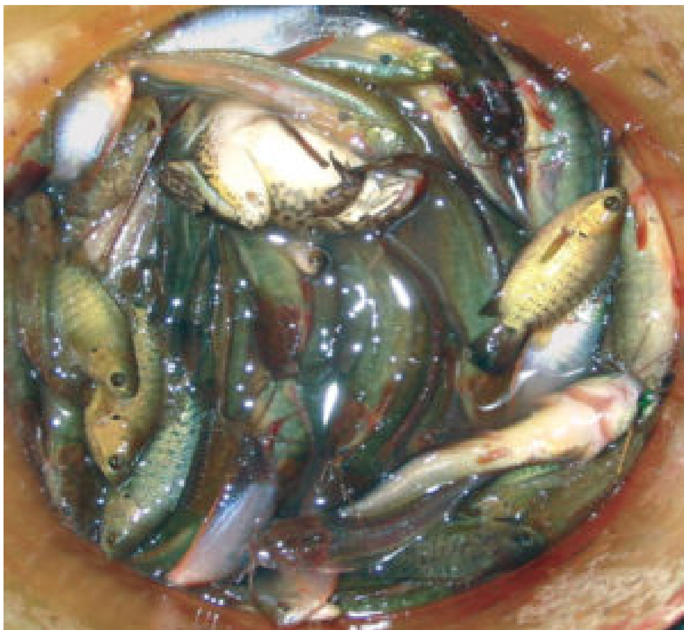
This harvest from a household pond in Cambodia includes frogs and multiple fish species.