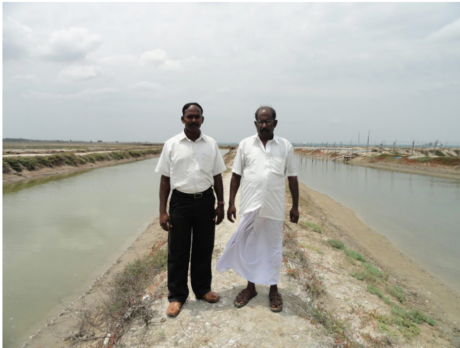
View of shrimp farmers and recirculation canals at a shrimp farm in Tamil Nadu, India.

Aquaculture, one of the fastest growing food-producing sectors that habitually develops in unutilized coastal areas, can face significant risks due to extreme weather events. Changing climates can increase the intensity and frequency of extreme weather events like cyclones and floods, and many coastal regions where shrimp farming takes place are often the worst affected.