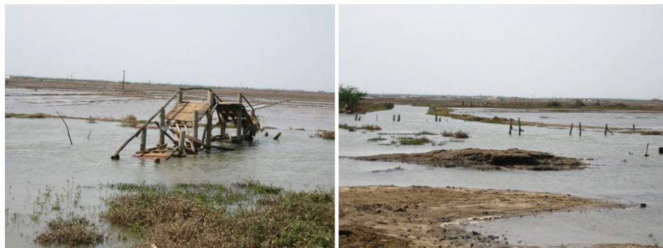
Views of flood-damaged shrimp ponds.