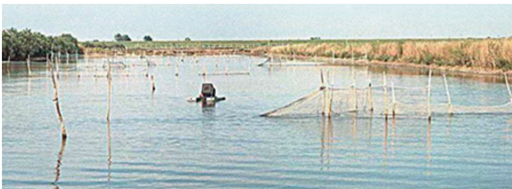
In Italy, typical earthen ponds use fyke-net traps for partial and final harvesting.

Recent research with M. japonicus has established an effective management protocol for production at three to four animals per square meter. This model includes the use of dry chicken manure as organic fertilizer during pond preparation, low water-exchange rates, and less-expensive compound diets to complement natural productivity.