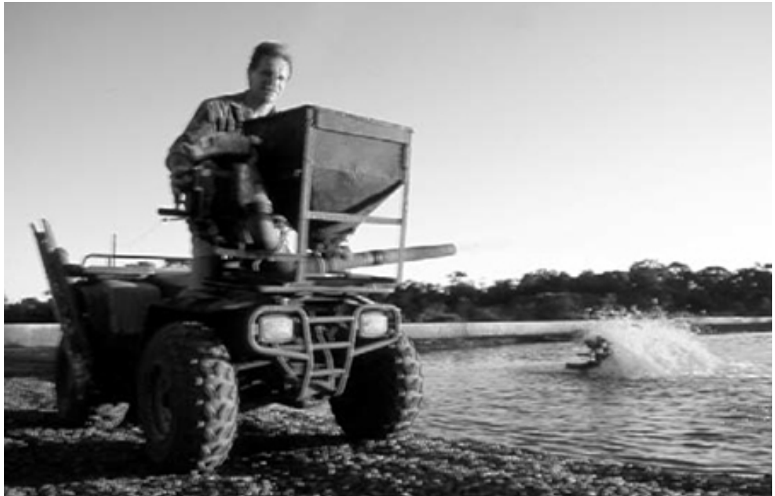
Fig. 2: Feed is usually delivered by motor-driven blowers at Australian shrimp farms.