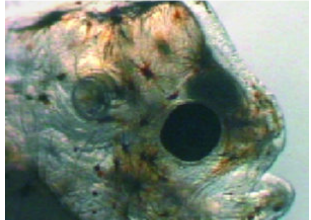
Close-up of larval Senegal sole.

These results are in agreement with research previously reported for turbot ( Scophthalmus maximus ) and halibut ( Hippoglossus hippoglossus ). The addition of algae improved the growth and survival of larvae by modifying bacterial flora in the water and stabilizing rotifer nutritional quality. Moreover, the lipid content and fatty acid composition of the larvae reflected the composition of the microalgae used, and so may be an effective tool to control fatty acid content.