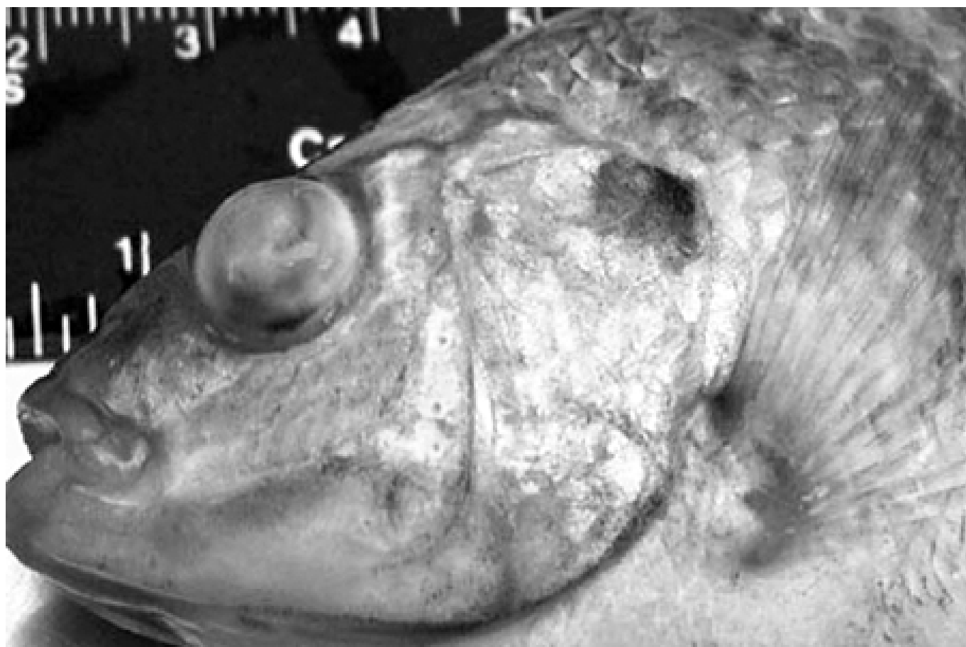
Fig. 1: This blue tilapia shows corneal opacity and exophthalmia three weeks after infection with S. iniae .