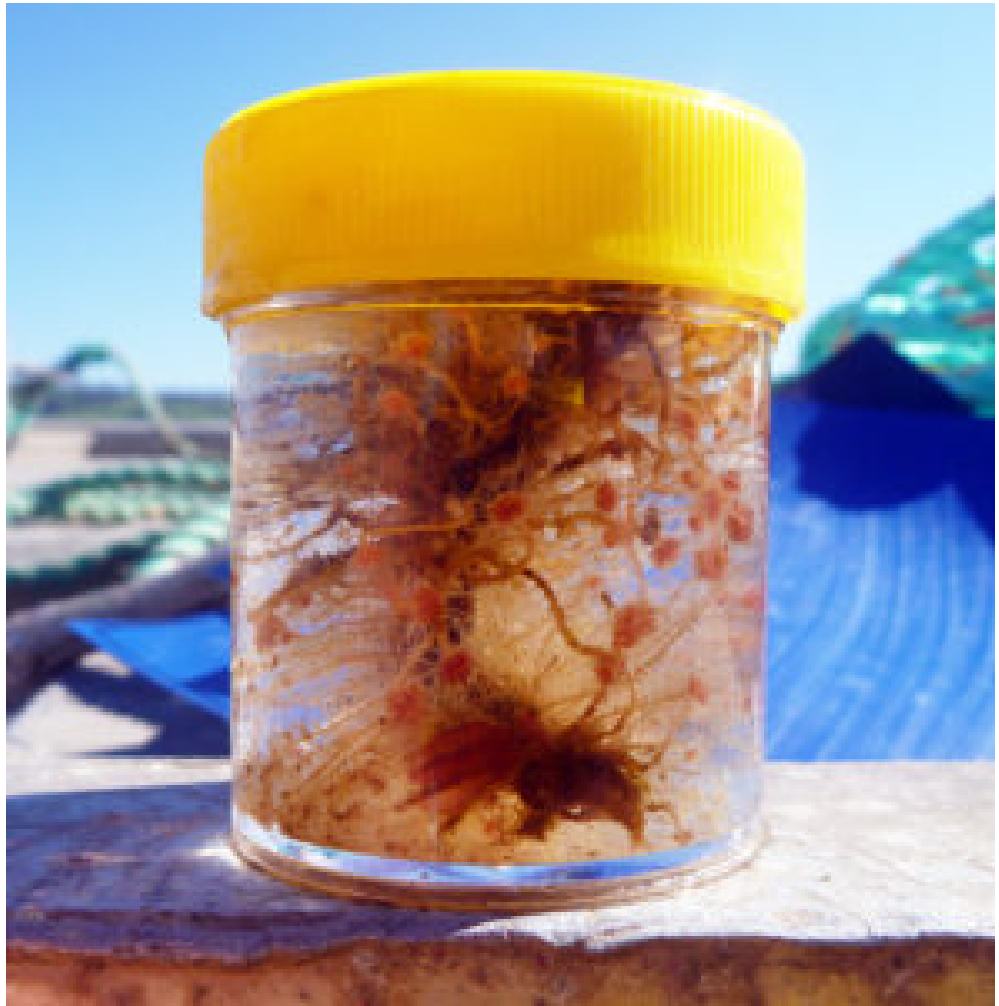
The authors identified Ectopleura crocea as a major net-fouling organism.