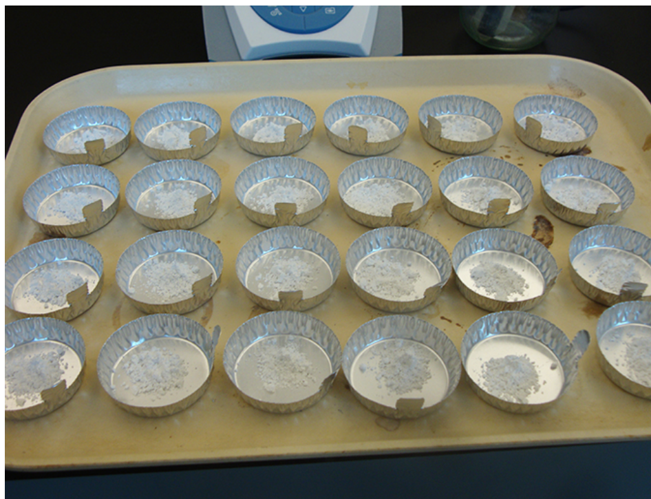
Five different agricultural limestone products plus pure \text{CaCO}_3 were tested for solubility in water (n = 4).

Water samples of 100 mL were removed from flasks before applications of agricultural limestone, 24 hours after application, and weekly for nine weeks. The flasks were set on a laboratory bench at 23 to 25 degrees-C with mouths open to the atmosphere. At the end of each working week, the plastic containers were capped and their contents manually stirred for 10 seconds.