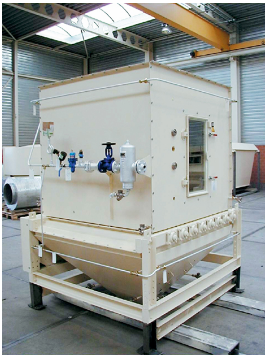
Postpellet conditioner.