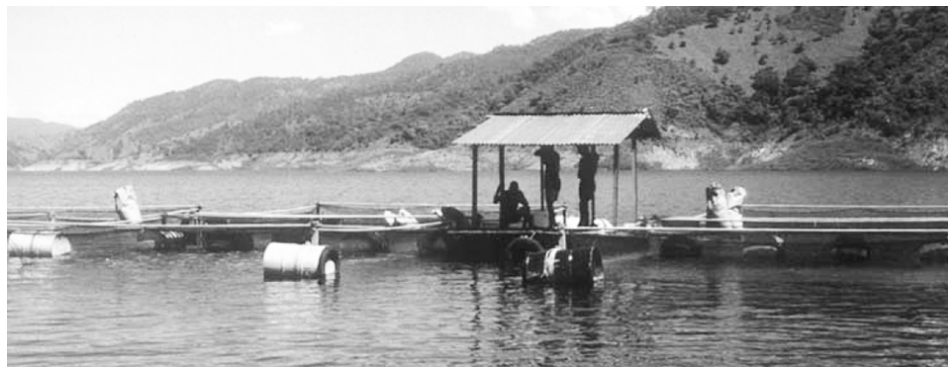
Tilapia cage module in El Cajon hydroelectric reservoir, Honduras.

After sex reversal treatment, fingerling are reared in 0.3-ha earthen ponds to an advanced fingerling size. Fingerlings stocked into ponds at an average of 26 fish per square meter grow from 0.5 to 37.1 g in 67 days. Harvest biomass averages 5,169 kilograms per hectare. Fingerling survival averages 71 percent. Fish are fed a 30 percent protein extruded feed, six days per week. On many farms, pond water quality is managed by exchanging from 5 to 20 percent of pond volume daily. Standing crop at harvest tends to be higher in ponds that receive water exchange (6,800 kilograms per hectare) compared to ponds without water exchange (3,538 kilograms per hectare). Aerators rarely are used in ponds during the nursery phase.