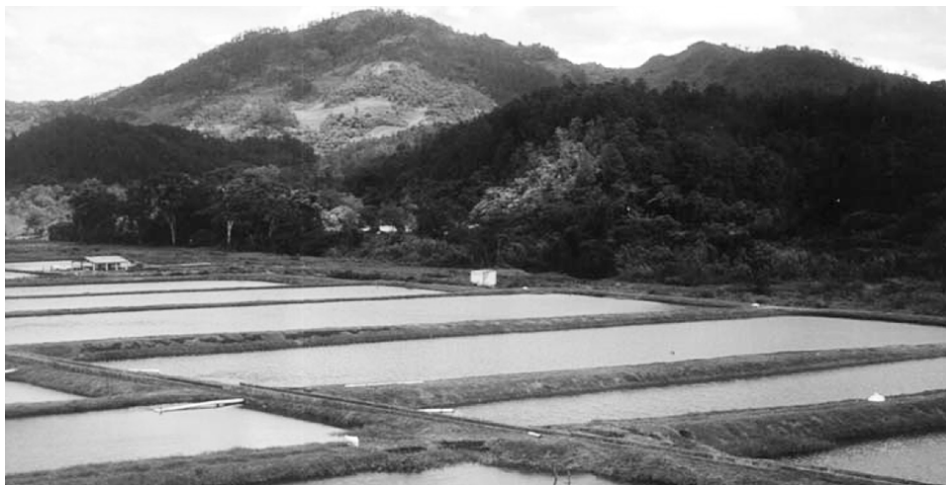
Tilapia grow-out ponds at Granja Mirador Sta Rita de Copan in Honduras.

Continued development of domestic and export markets will stimulate expansion of existing farms and development of new farms to meet demand