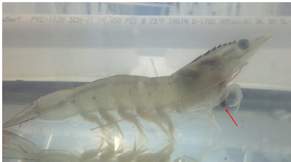
Shrimp consuming a manufactured feed pellet.