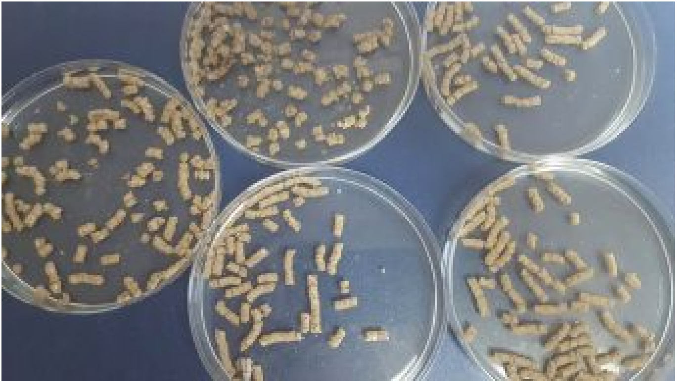
Extruded feed pellets (longer ones, on bottom and right) maintain their hydrostability longer than pelletized ones, and have a softer, more pliable texture.