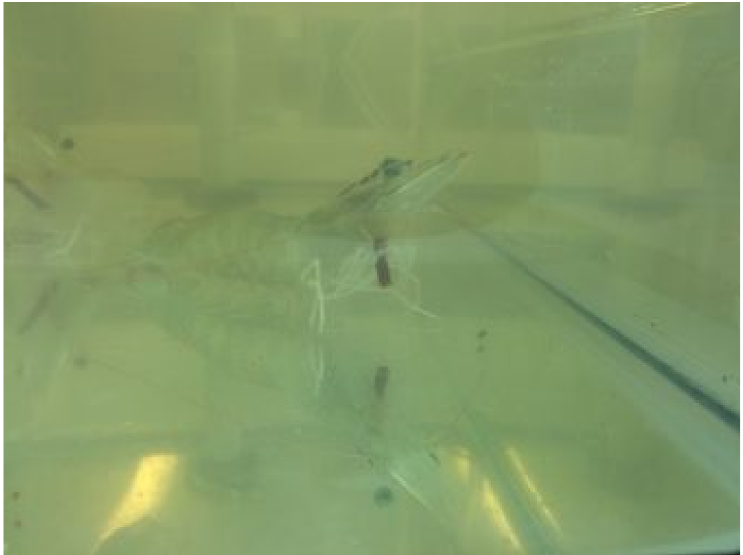
Shrimp can better consume softer pellets than hard ones.