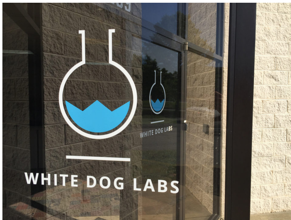
White Dog Labs is based in New Castle, Del., USA.

"It was a very positive, encouraging response we saw," said Dumas.