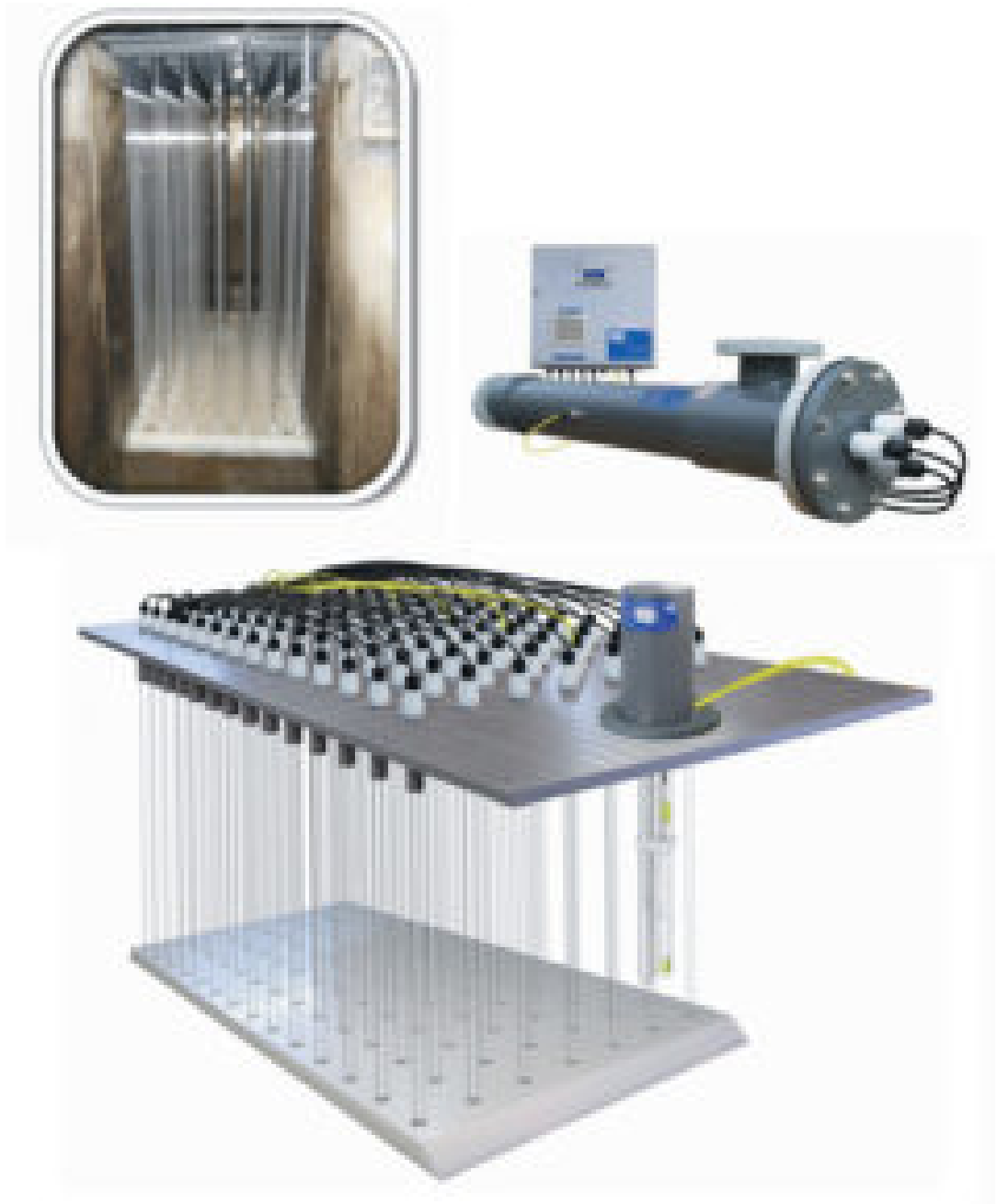
New U.V. light system designs offer greater dependability and cost effectiveness.

In RAS with high flow rates, high U.V. dose requirements or low UVT, the preferred method is to use a low-head channel U.V. array. In the past, the typical channel array consisted of several lamps spaced evenly in a series of horizontal racks. These were submerged in the water column or channel, through which all the water must pass before returning to the pumping sump or culture tank.