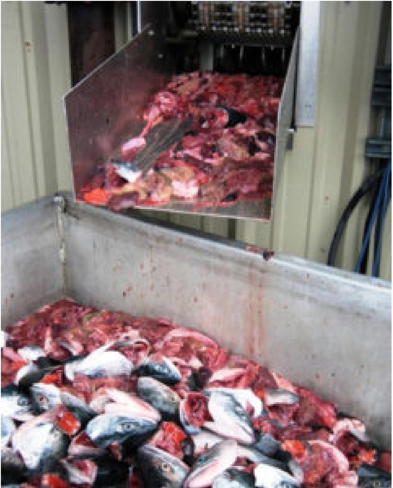
Trimblings from seafood processing join various plant products and even algae as protein and oil alternatives to fishmeal and fish oil in aquaculture feed.