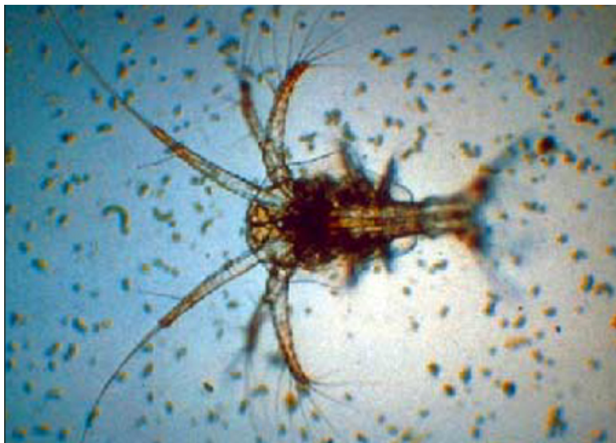
Penaeus vannamei zoea and rehydrated Spirulina .

Phycocyanin (a polypeptide) and Spirulina polysaccharides are two of the key immunoactive substances Spirulina delivers. These substances are being studied for health benefits to humans and high-value animals. When preparing feeds, care should be taken to use a Spirulina source with the highest possible amounts of these substances. Spirulina can vary in amounts of phycocyanin, and a source with at least 10 percent phycocyanin content should be used.