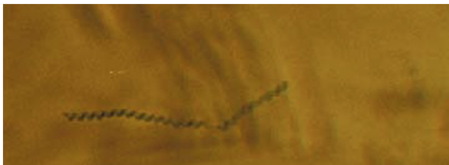
Marine Spirulina .

Best results are achieved when Spirulina is used in combination with fat-rich, live algae like diatoms. Spirulina powder is very rich in protein and vitamins, but does not contain enough fat for growing larvae. Fat-rich diatoms, together with dried Spirulina , can form an ideal diet that results in very strong postlarvae. Dried Spirulina may be used at each feeding, or the hatchery operator may want to