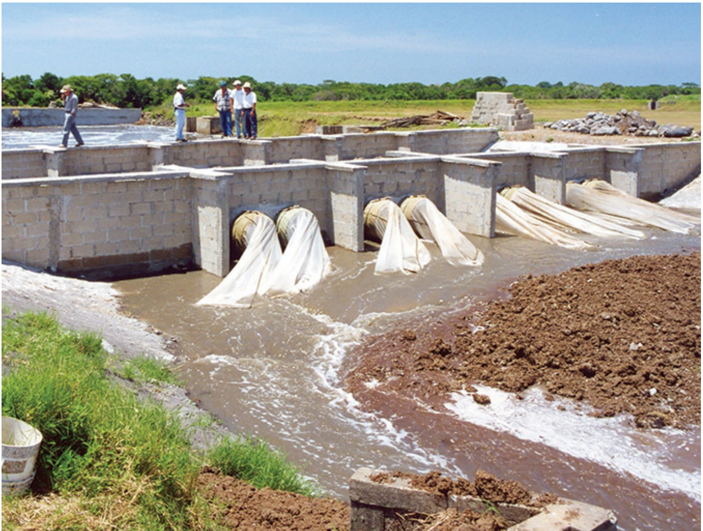
Successful Vibrio control strategies must revolve around limiting inputs, including those that come in with the water. Proper pond preparation is essential, as well.